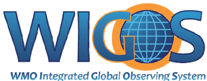
Figure: WIGOS logo

13.2 The president of CBS presented a proposed WIGOS logo (see Figure below). Comments expressed during the discussion include: the necessity of adding other logos (e.g. GCOS, GOOS, GTOS) to more fully represent WMO contribution; to have alternative logos to ensure the best choice; to ensure that the logo should be simple as much as possible and easily interpreted including colours used. EC-WG/WIGOS-WIS welcomed the initiative to have a WIGOS Logo and requested to coordinate its design in consultation with all concerned.